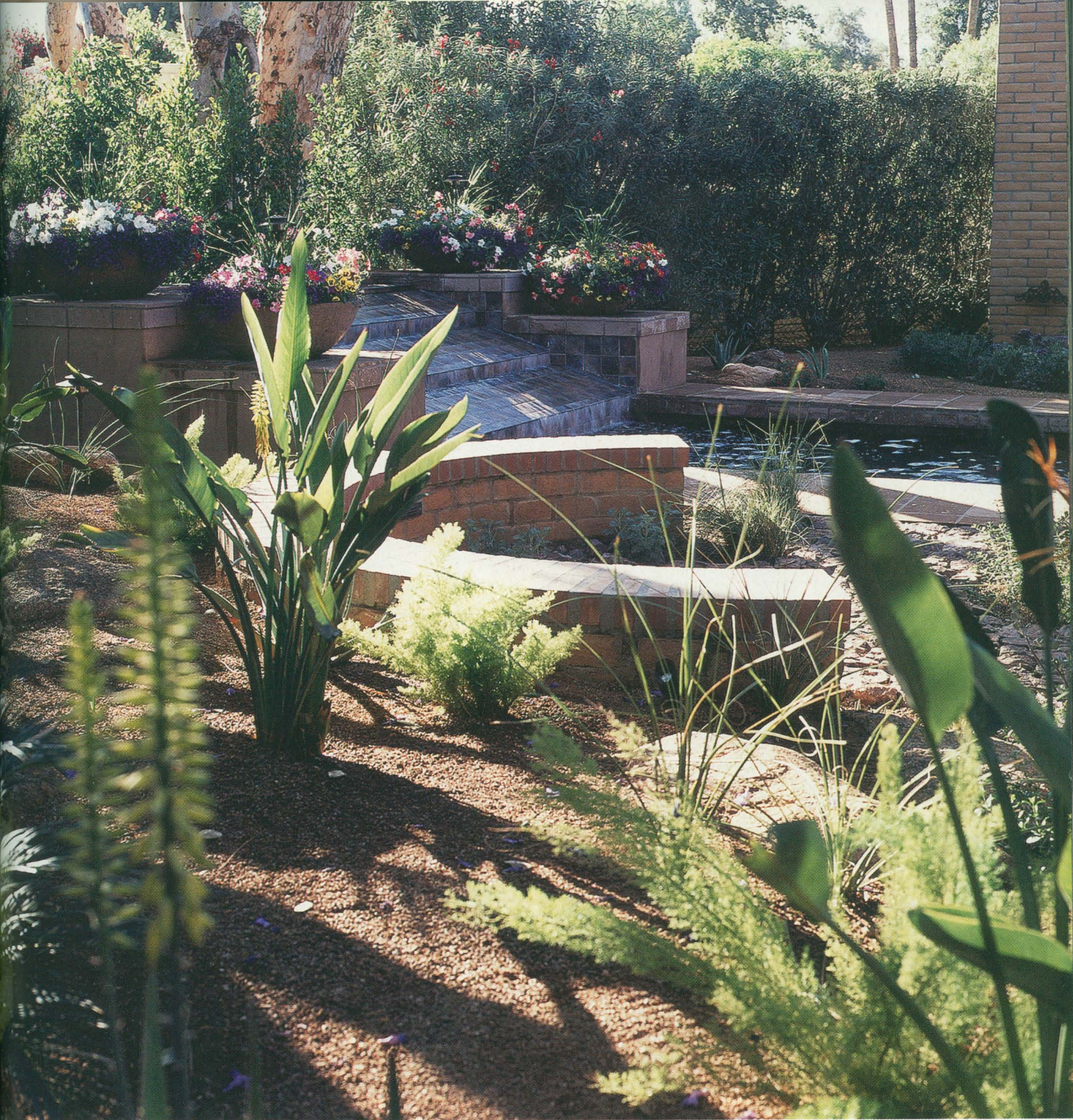
An eclectic mix of vegetation serves as a backdrop for several sitting areas and water features in the back yard. Plants were chosen to provide a combination of textures and heights.

son and his friends to play or watch television.