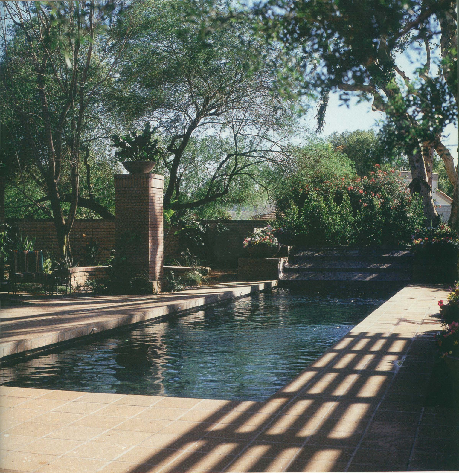
The pool's clean lines and stepped water feature suit the home's design. Saltillo tiles repeated throughout the property connect the water feature to a covered ramada, outdoor fireplace and private sitting areas.

Bankord situated eye-catching accents throughout the property. Near the front door, carved cantera cubes from Mexico were transformed into side-by-side fountains to envelop visitors with the sound of moving water. He designed iron gates and rain scuppers to replace the existing wood ones, which were starting to deteriorate. To reduce splash and erosion from rain, Bankord placed chiseled stone vessels beneath the scuppers. "Rainwater