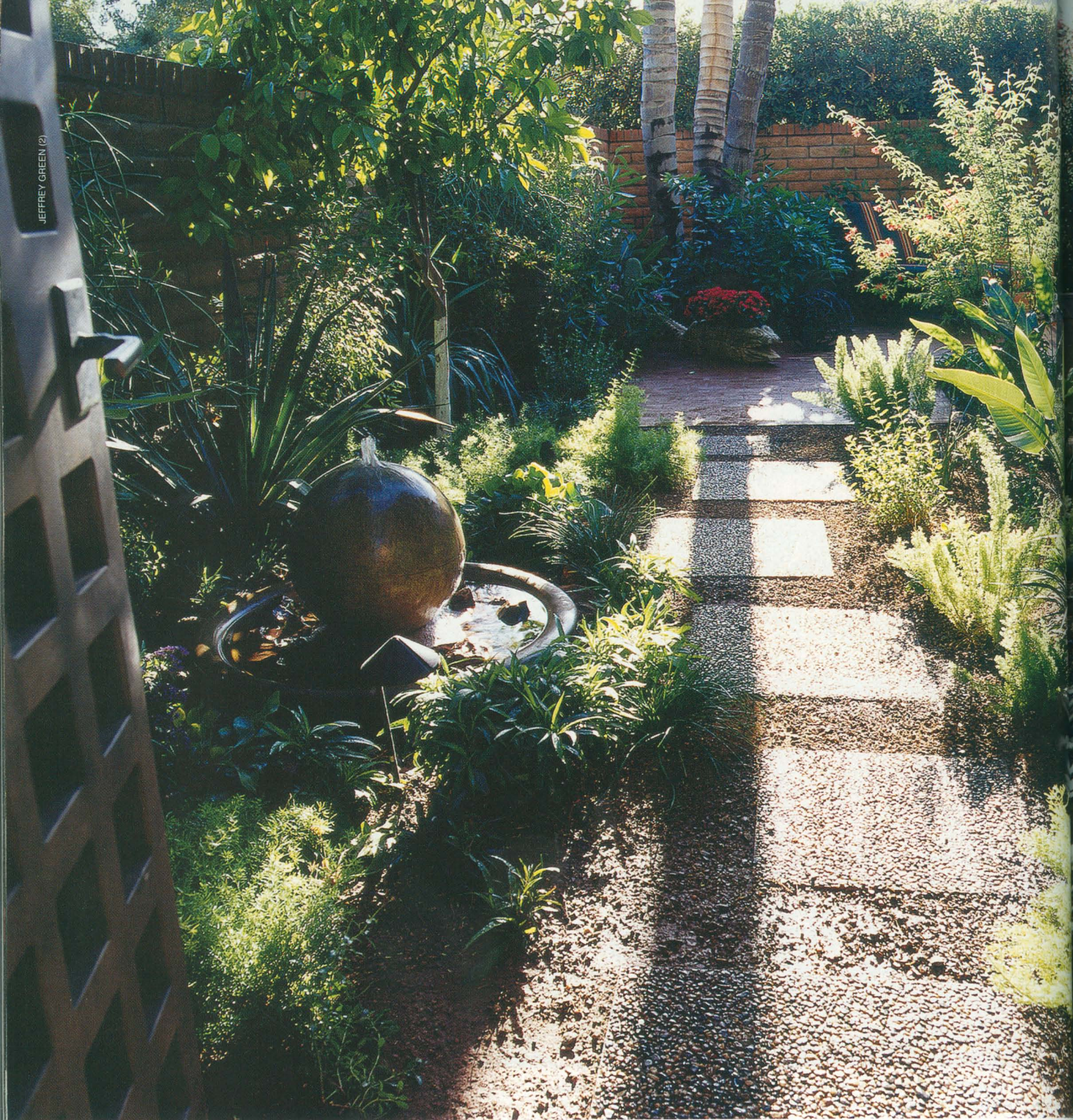
A pathway that begins at the side of the house opens the garden to exploration. A fountain was positioned nearby to mask neighborhood noise.

the Bermuda. A straight, narrow sidewalk was replaced with 6-foot-wide pavers laid in a zigzag pattern. This new walkway provides visual appeal from the street and also creates a more interesting passage through the new plantings to the home's entry area.