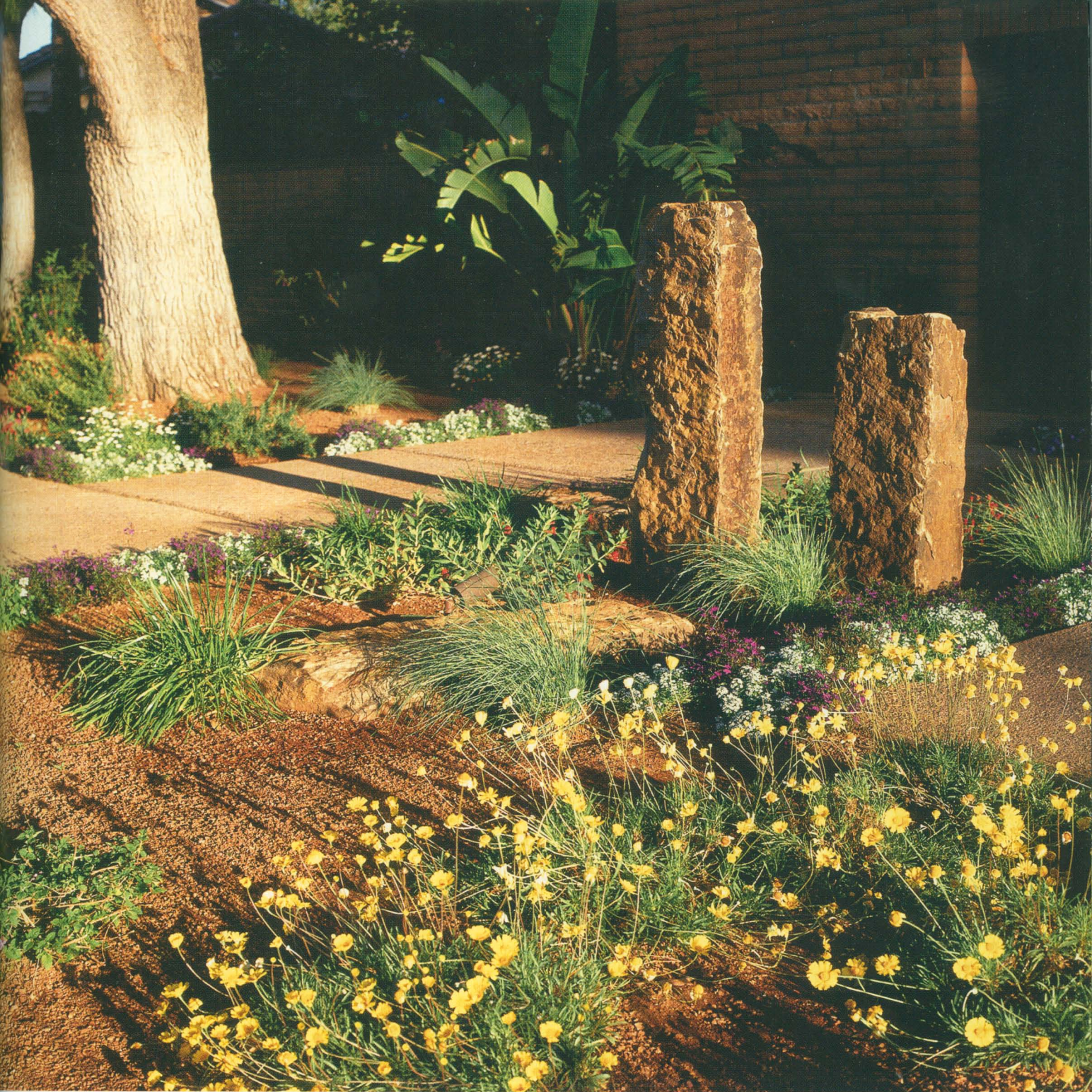
Above: The front yard features a miniature version of Stonehenge made of hefty rock known as "Oklahoma farm beams." • Right: Muhlenbergia 'Regal Mist' produces a stunning display of rosy-pink plumes in fall.