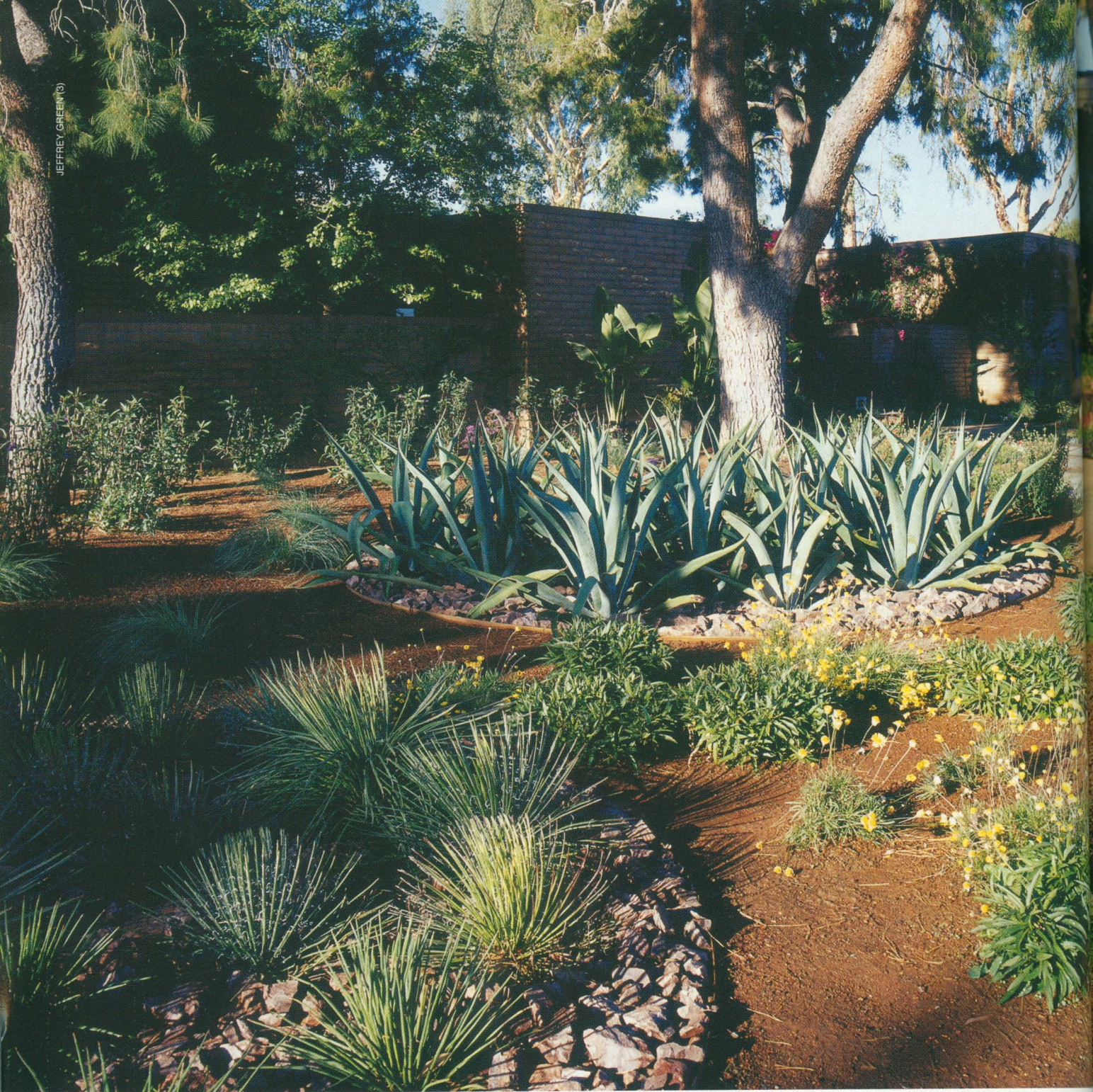
Above: Groupings of Agave geminiflora (foreground) and octopus agave (around tree) provide a sense of uniformity to the front yard. Left: Stone spheres complement the home's contemporary styling.

If you find yourself living with a landscape left over from an earlier design era, take heart. It can be updated dramatically with modern hardscape materials and a far more varied plant selection than was available 10 or 20 years ago.