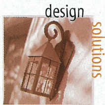
Text by Troy Bankord • Illustration by Clint Miller

W ater features don't have to be large or extravagant to create a soothing effect in the garden. Even filling the natural depression of a flat stone with water makes a subtle, organic statement in the garden, on a patio or in a courtyard.